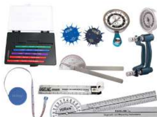
8-piece evaluation set