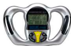
hand held body fat analyzer

Want more information? Find these and many more products at FabEnt.com