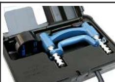
digital hand dynamometer