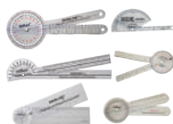
6-piece plastic Hi-Res™ goniometer set