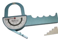
2-sided skinfold caliper