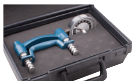
ER™ Hi-Res™ hand dynamometer