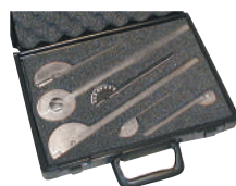
6-piece stainless steel goniometer set