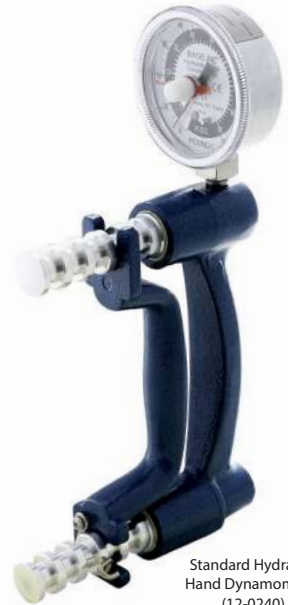
Standard Hydraulic Hand Dynamometer (12-0240)

If maximum effort was exerted there should be approximately a 10% variation in the two sets of test results.