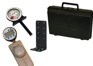
wrist evaluation set