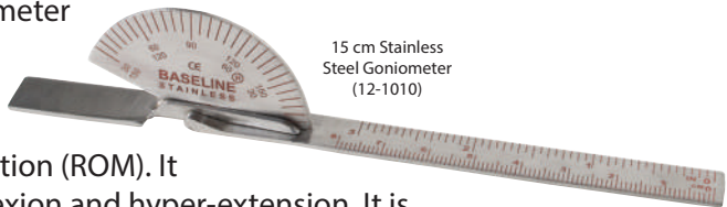
15 cm Stainless Steel Goniometer (12-1010)

Align the fulcrum of the goniometer with the anatomical fulcrum of the joint being measured. Place the flat arm of goniometer that is attached to the dial indicator on the center of the limb (or extremity) to be measured. Hold both arms of the goniometer and move the joint through its entire range of motion (this can be done actively by the subject or passively by the examiner). The range of motion can be read directly from the dial indicator