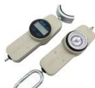
hydraulic push-pull dynamometer