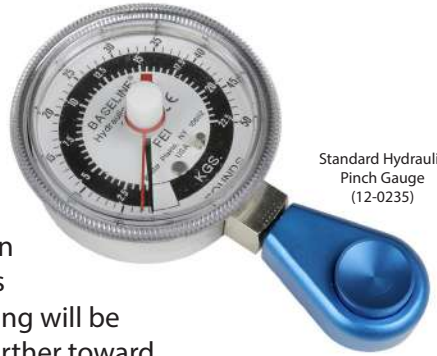
Standard Hydraulic Pinch Gauge (12-0235)