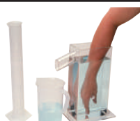
hand volumetric edema gauges