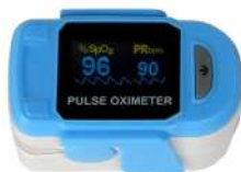
fingertip pulse oximeter