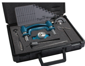
7-piece hand evaluation set

the most complete line of instruments for the physical therapist