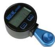
digital hydraulic pinch gauge